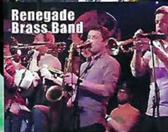
Renegade Brass Band

See the full line-up at rvjazzfestival.co.uk